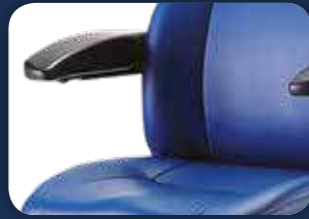
Cushions Body contoured cushions for comfort and support