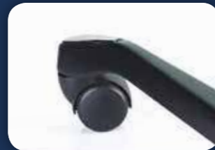
Castors Robust black double wheeled castors