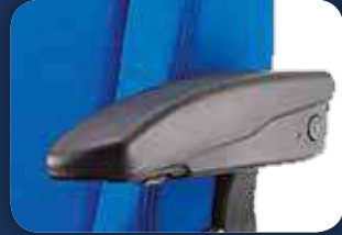
Tip-up Armrest 30° tilt adjustment to maximise elbow and arm support. Retractable for desktop access