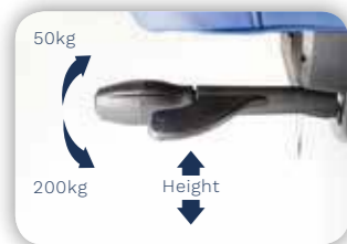
Height Adjustment and Tilt Rocker Adjustment Weight adjustment 50-200kg