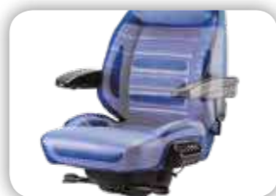
KAB Air Comfort System (ACS) To mould the chair simply press the + symbol to inflate and - symbol to deflate. Main charge is supplied to boost the 12v rechargeable battery every 3-4 months (subject to usage)